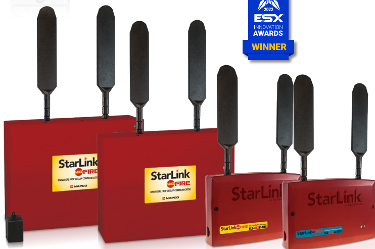
StarLink Max Fire 5G LTE-M code-compliant standard or metal models on choice of Verizon or AT&T networks