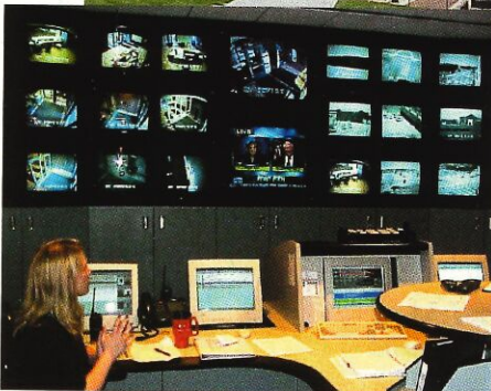
The Sprint World Headquarters, located in Overland Park, Kan., will house 15,000 people, and includes restaurants, drycleaners, a fitness center, and a security command center that manages about 60 percent of all Sprint facilities.